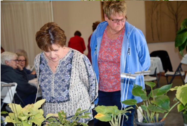
Founders' Day Picnic at Tomasheks' Farm in Preston